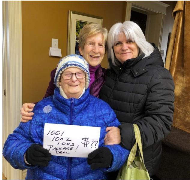
The Prep Team